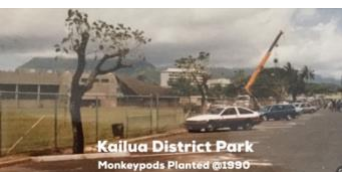
Kailua District Park Monkeypods Planted ©1990

1980 ~ LKOC designed and installed the tree-filled Aikahi Triangle Park .