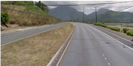
Kailua Road without LKOC beautification