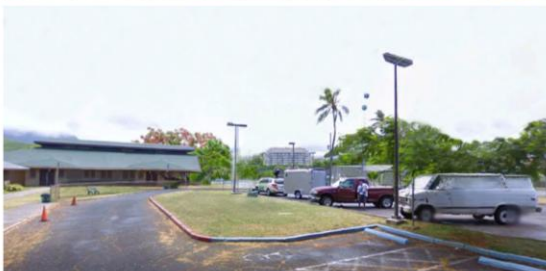
Kailua Recreation Center without LKOC beautification