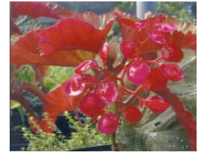
Red blossomed angel wing begonia