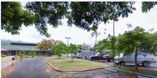
Kailua Recreation Center