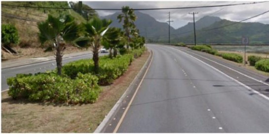
Kailua Road heading towards Pali