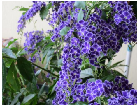
Golden dew drop