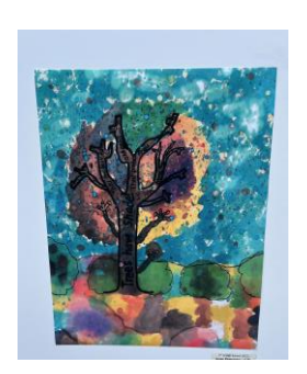
3<sup>rd</sup> Grade Keiki Art Contest winner from Keolu Elementary School

In recognition of Arbor Day, the Lani-Kailua Outdoor Circle (LKOC), in partnership with Smart Trees Pacific, hosted a free tree giveaway on Saturday, November 5, 2022, at which hundreds of trees were adopted by residents. The Arbor Day trees and plants were presented to the public at the Kailua United Methodist Church on Kailua Road. Over 300 ornamental, fruit, and native trees and shrubs were available. This LKOC event was one of several being held on Oahu, and people from all over the island came to adopt a tree at the Kailua event. Funding for the trees and plants was provided by Alexander & Baldwin Hawai'i and LKOC. Specimens included those purchased from local nurseries and those propagated by students at LKOC's Learning to Grow Program plant nursery at the Women's Community Correctional Center in Kailua. There were educational and information booths, Master Gardeners and arborists to answer questions, and tree trimmer/climber demonstrations. A special presentation announced the annual "We Love Trees" Keiki Art contest winners. There were over 350 submissions from elementary schools across the state, and 18 were chosen as winners who each received a tree.