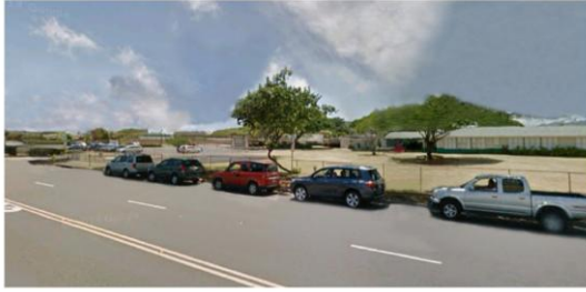
Kailua Road without LKOC beautification

We are looking for a few good Chairs. The committees for our annual Holiday House Tour and our WCC Scholarship Program are in need of leadership. Our wonderful long time heads of these two committees, Holly Turl and Claudia Webster, are stepping down. We owe them a huge debt of gratitude for all they have contributed to the success of these events and programs, and we are going to miss them. Luckily, they have compiled very good documentation on the details of what is involved in each position, so if you are interested, or know someone who might be, please, please e-mail us at lani-kailua@outdoorcircle.org .