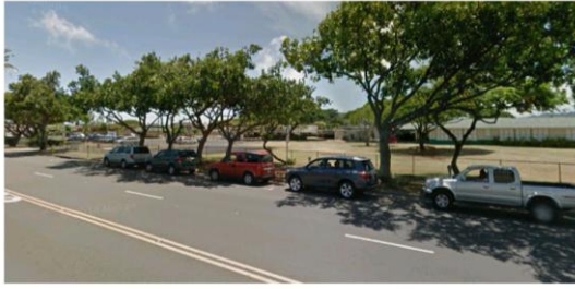
Kailua Road fronting Kailua Elementary School