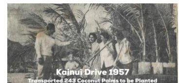
Kainui Drive 1957 Transported 243 Coconut Palms to be Planted

1950s, 1960s ~ LKOC planted hundreds of street trees on Oneawa, Uluniu, Maluniu, Kainehe, Kihapai, and Hoolai streets, as well as on school grounds, parks and neighborhoods and in newly developed Enchanted Lake.