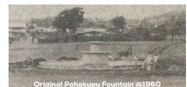
Original Pohakupu Fountain @1960

1991 ~ LKOC installed the landscaping and trees around the Pohakupu Fountain when it was rebuilt.