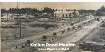
Kailua Road Median Trees Planted 1949

1949 ~ LKOC planted dozens of Tecoma trees on the Kailua Road median entering central Kailua. In 1950 , a major roadway upgrade replaced these with Kamani trees. Since 2000 , LKOC has funded the landscape maintenance of the median down to Kuulei Road.