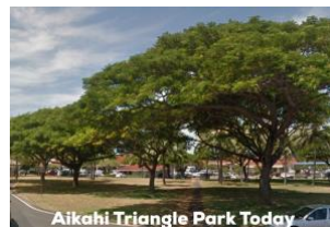
Aikahi Triangle Park Today

1991 ~ LKOC installed the landscaping and trees around the Pohakupu Fountain when it was rebuilt.