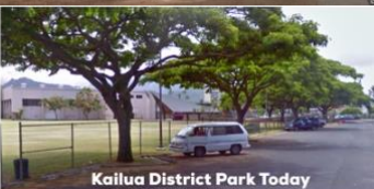
Kailua District Park Today

1990 ~ LKOC spearheaded planting of the Monkeypods at Kailua District Park along Kainalu Drive.