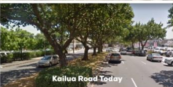
Kailua Road Today

1949 ~ LKOC planted dozens of Tecoma trees on the Kailua Road median entering central Kailua. In 1950 , a major roadway upgrade replaced these with Kamani trees. Since 2000 , LKOC has funded the landscape maintenance of the median down to Kuulei Road.