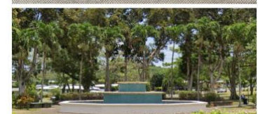
Pohakupu Fountain Today

To learn more about our beautification projects, visit