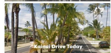
Kainui Drive Today