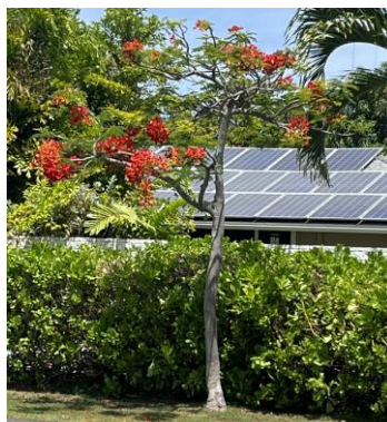
S. Kainalu Drive: younger poinciana tree