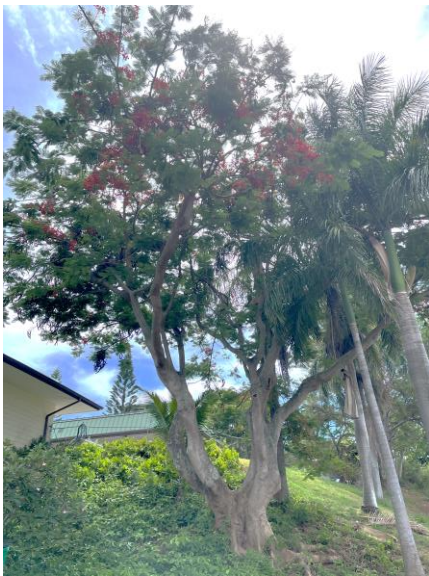
Keolumana United Methodist Church: Kailua granddaddy of poinciana trees

There are other places where you can see poinciana trees thriving in Kailua. Most notably, there are over twenty poinciana trees growing along South Kainalu Drive that stretch from Kuulei Road to Kailua Road. Many of the older trees were planted by LKOC in 1954. Over the years, the city has continued to prune and replant when necessary, and there is a mixture of younger and older trees which you can identify by the tree trunks. Also on South Kainalu Drive, there are several poinciana trees growing at Kailua Intermediate School, two of which were planted by LKOC in 2002.