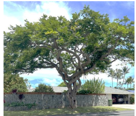
S. Kainalu Drive: older poinciana tree