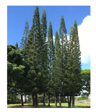
Grove of Norfolk Island pine trees at back of Kaneohe District Park Playground

You can view some public Cook pine trees in the medial strip on Kainui Drive mauka of Maluniu Avenue and also one at the Kailua Police Station. The only public place that has been found to have Norfolk Island pines on the Windward Side is across the field at the Kaneohe District Park Playground. You can also see Norfolks in Manoa and Palolo. Use the interactive Hawai'i Citizen Forester Tree Plotter Inventory map (https://pg-cloud.com/hawaii) to locate these trees. Click on the Organization (e.g., Kaneohe), then click on Toggle All to uncheck all boxes. Next, scroll down the list and check the boxes for Cook pine and Norfolk Island pine if they are available for that site. You can then zoom in on the map to find the little colored circles that show the locations of these trees. By clicking on the circles in the map, you can view other information such as photos or street views and height of the trees.