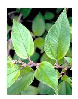
Mamaki (endemic) Pipturus albidus