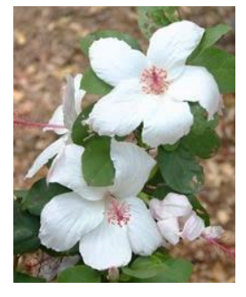
Koki'o ke'oke'o (endemic) Hibiscus Waimeae