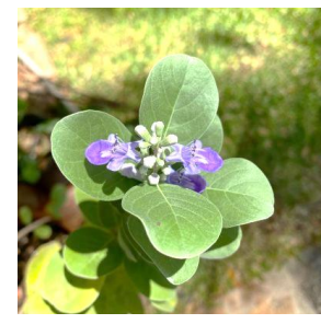
Pohinahina (indigenous) Vitex rotundifolia

Here are some examples of native plants suggested by the Hawai'i Forest Institute.