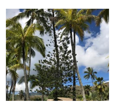
Bent trunk of Cook tree Kainui Drive

The strongest identifier of these two types of trees is their tree bark. In large adult trees, the Cook bark is flaky and peels off in rolls. The Norfolks do not have much peeling.