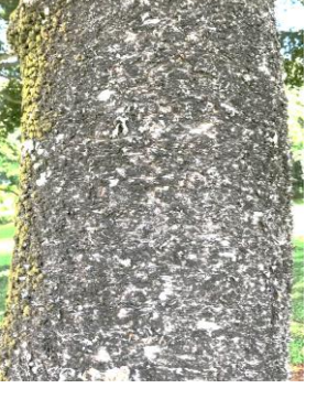
Norfolk Island pine bark Kaneohe District Park

Another way to recognize the Cook pines is by looking at their tree trunks. Cook pine trunks may bend as they get taller.