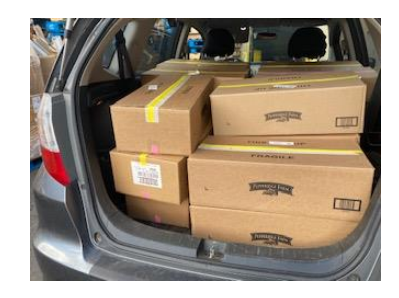
Pepperidge Farm boxes holding 20 cases of WCCC lettuce