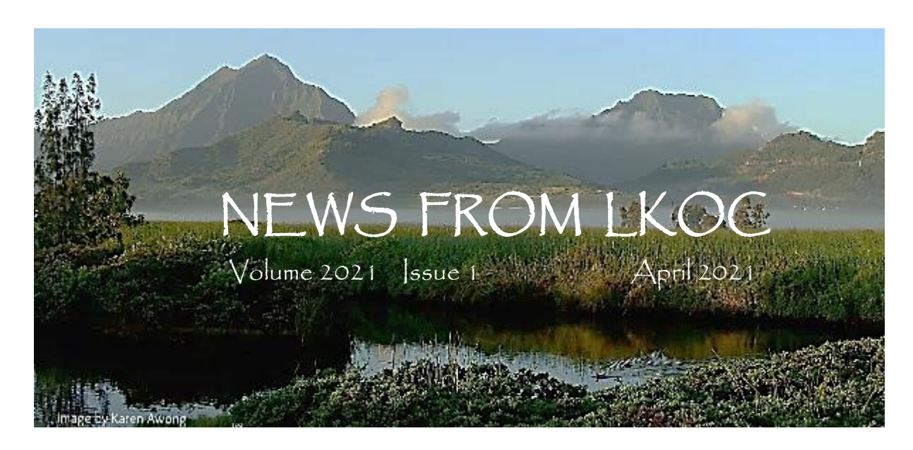
Aloha LKOC members and supporters,

We are excited to announce that we are collaborating with the Kailua Historical Society who has agreed to publish the history of our branch as part of their " Kailua Way Back When... " pamphlet series. These will be available for a nominal purchase price at various locations in Kailua, where proceeds will go to the Kailua Historical Society. Our 70-plus year history is quite remarkable, and we hope you will enjoy our story. Here is a snippet.