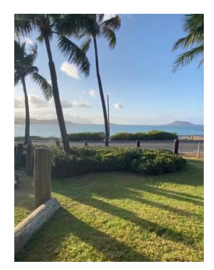
Alala Point 2020

Alala Point is the highest point at the entrance to Lanikai. In July 2019, LKOC completed a landscape refurbishment project in the upper parking lot across the street from the stone pillar overlooking Kailua bay. New lawn and wax ficus hedges were installed. The Community Service Workline (CSW) from the Women's Community Correctional Center (WCCC) had been continuing its long-standing maintenance of the entire Alala Point area under LKOC support. Then with the arrival of COVID-19, WCCC was forced into a lockdown, and the new landscaping at Alala Point suffered. In the interim, a small group of LKOC volunteers and community members has been keeping the area weeded and mowed. A spraying of the invasive grasses by our contractor, Steve Dewald, has also been extremely helpful, and as a result, the new wax ficus hedge and lawn are doing very well.