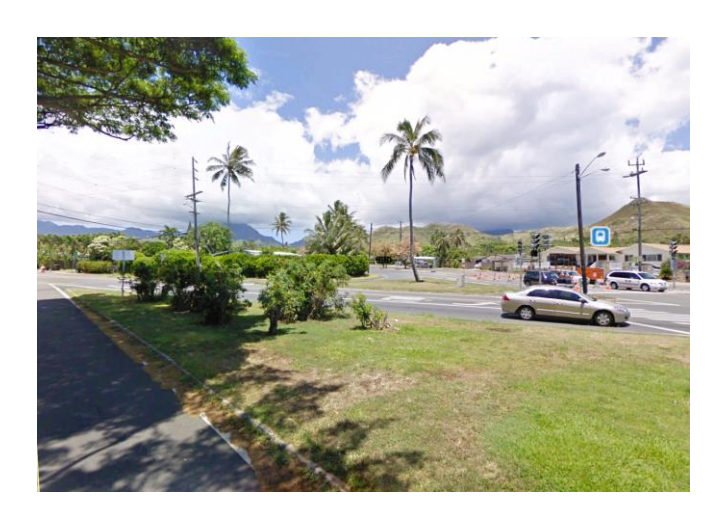
Pali Palms Triangle Before Landscaping

Landscaping is a dynamic entity, and we sometimes must change our design over time to meet the needs and challenges of the environment. The Pali Palms triangle on the corner of North Kalaheo Avenue and Mokapu Road is a good example. That plot goes from full shade to extreme sun and is exposed to car exhaust due to its location on a busy thoroughfare. The Pali Palms triangle landscaping was originally designed and installed by the Lani-Kailua Outdoor Circle (LKOC) in 2011 to beautify this barren traffic triangle. Hele Mai Lawn & Garden has been maintaining the landscaping and irrigation for LKOC since then. Our group is committed to making sure our projects continue to be sustainable and beautiful. During the middle of August, over one hundred new bromeliads of three varieties were donated by our members and planted by Hele Mai in the triangle. Hele Mai also donated the mulch that they added in the planter beds to help the landscaping retain moisture. With bromeliads, which are fairly drought tolerant, we are expecting a successful result.