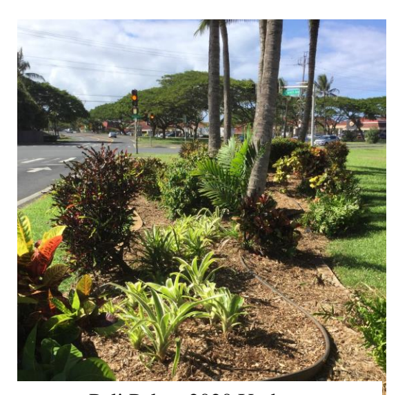
Pali Palms 2020 Update