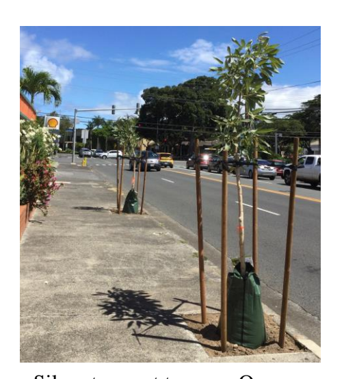
Silver trumpet trees on Oneawa

The Oneawa Street tree project is LKOC's latest beautification venture. In mid-August, a city crew started and finished the Oneawa Street tree planting project that LKOC proposed to the city last fall. Eight new white tecoma and silver trumpet trees were planted between Kawainui Street and Kuulei Road to replace those that had been removed over the past twenty years due to age and deterioration. Each tree was fertilized, mulched, staked, and a water bag was installed. Part of the planting project includes a 90-day maintenance period by the installer where the trees will get watered twice a week. Thanks to Island Landscaping and Maintenance who did the installation for the city. Now we can all look forward to a nice bower of trees along the street.