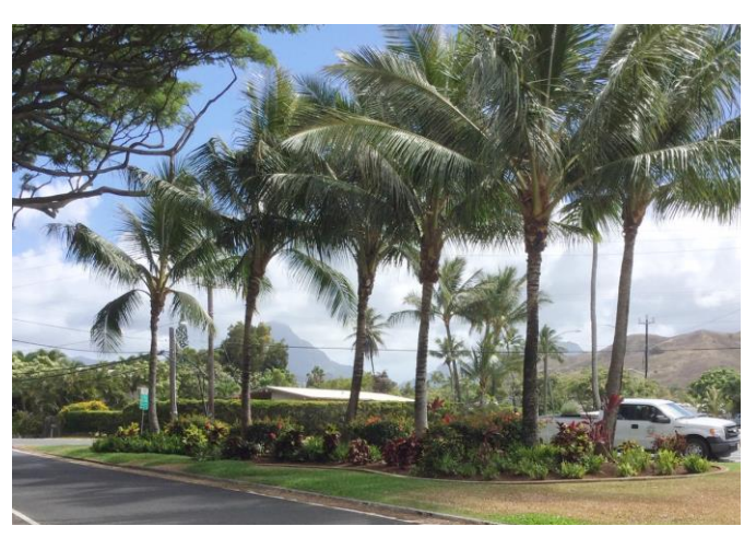
Pali Palms 2011 After Landscaping