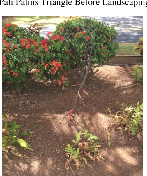
Pali Palms Prior to 2020 Update