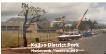
Kailua District Park Monkeypods Planted ©1990

1980 ~ LKOC designed and installed the tree-filled Aikahi Triangle Park .