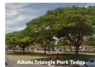
Aikahi Triangle Park Today

1991 ~ LKOC installed the landscaping and trees around the Pohakupu Fountain when it was rebuilt.