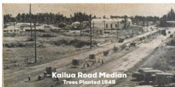
Kailua Road Median Trees Planted 1949

1949 ~ LKOC planted dozens of Tecoma trees on the Kailua Road median entering central Kailua. In 1950 , a major roadway upgrade replaced these with Kamani trees. Since 2000 , LKOC has funded the landscape maintenance of the median down to Kuulei Road.