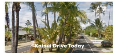
Kainui Drive Today

1950s, 1960s ~ LKOC planted hundreds of street trees on Onewa, Uluniu, Maluniu, Kainehe, Kihapai, and Hoolai streets, as well as on school grounds, in parks and neighborhoods and in our newly developing Enchanted Lake subdivisions.