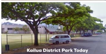
Kailua District Park Today