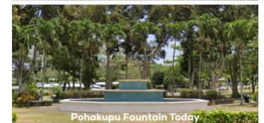
Pohakupu Fountain Today

1991 ~ LKOC installed the landscaping and trees around the Pohakupu Fountain when it was rebuilt.