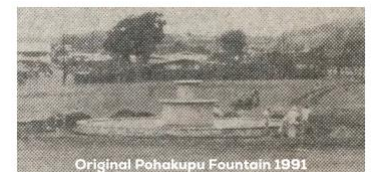
Original Pohakupu Fountain 1991

1990 ~ LKOC spearheaded planting of the Monkeypods at Kailua District Park along Kainalu Drive.