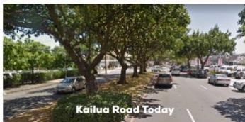
Kailua Road Today

1957 ~ LKOC collaborated to plant coconut trees in the Kainui Drive central median.