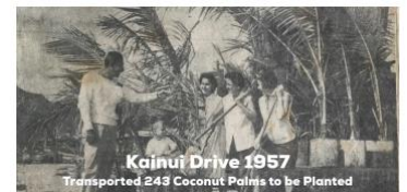
Kainui Drive 1957 Transported 243 Coconut Palms to be Planted

1949 ~ LKOC planted dozens of Tecoma trees on the Kailua Road median entering central Kailua. In 1950 , a major roadway upgrade replaced these with Kamani trees. Since 2000 , LKOC has funded the landscape maintenance of the median down to Kuulei Road.