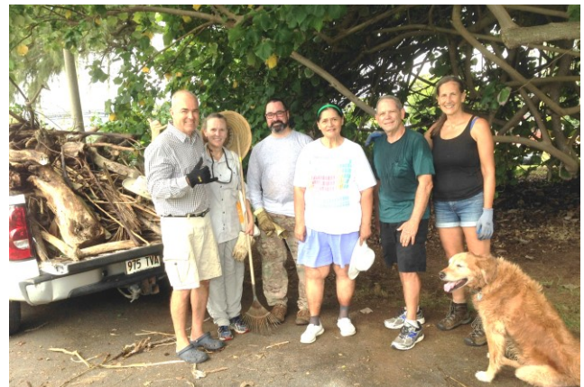
LKOC work crew at Kalama Beach Park