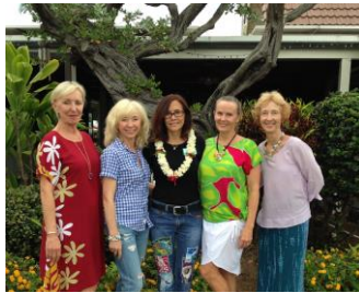
Fashion show models at May annual meeting & luncheon