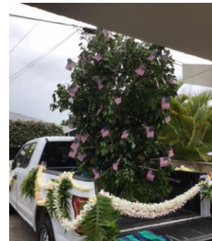
Fourth of July Parade tree of flags