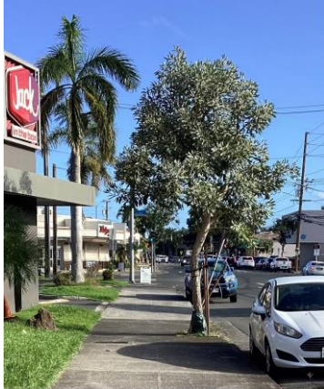
Silver trumpet tree (on the left)

In August 2020, LKOC spearheaded the planting of eight white tecoma and silver trumpet street trees on Oneawa Street, from Kuulei to Kawainui streets. While some of those trees had to be replaced, photos taken on January 13, 2023, show that some of the trees are thriving. Dedicated LKOC volunteers have continued to water them regularly.