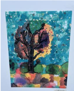
3 rd Grade Keiki Art Contest winner from Keolu Elementary School

In recognition of Arbor Day, the Lani-Kailua Outdoor Circle (LKOC), in partnership with Smart Trees Pacific, hosted a free tree giveaway on Saturday, November 5, 2022, at which hundreds of trees were adopted by residents. The Arbor Day trees and plants were presented to the public at the Kailua United Methodist Church on Kailua Road. Over 300 ornamental, fruit, and native trees and shrubs were available. This LKOC event was one of several being held on Oahu, and people from all over the island came to adopt a tree at the Kailua event. Funding for the trees and plants was provided by Alexander & Baldwin Hawai'i and LKOC. Specimens included those purchased from local nurseries and those propagated by students at LKOC's Learning to Grow Program plant nursery at the Women's Community Correctional Center in Kailua. There were educational and information booths, Master Gardeners and arborists to answer questions, and tree trimmer/climber demonstrations. A special presentation announced the annual "We Love Trees" Keiki Art contest winners. There were over 350 submissions from elementary schools across the state, and 18 were chosen as winners who each received a tree.