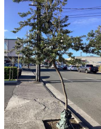
White dwarf tecoma tree (on the right)