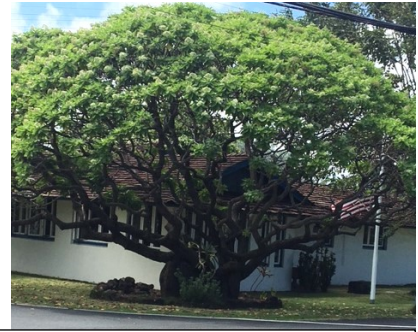
Heliotrope tree – salt tolerant

If there is a tree you appreciate, please help us let the owners know. We will write the owners a letter letting them know someone asked us to thank them for supporting our community by keeping the tree. Send an e-mail to Lani-kailua@outdoorcircle.org telling us where the tree is. If you can, send us a sentence or two about why you appreciate the tree. Your nomination will be kept anonymous. We will let the tree owner know others appreciate what they are doing to keep Kailua clean, green, and beautiful.