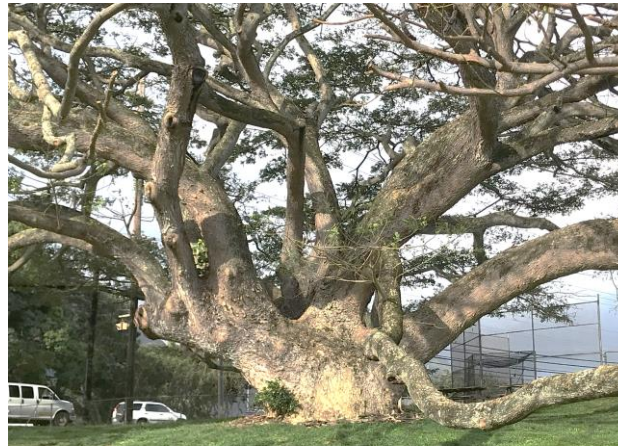
Big trunk of an exceptional monkeypod

Monkeypod trees were introduced into Hawai’i in the 1850s. The WCCC monkeypod trees are well over 100 years old. These trees are exceptional in size and beauty. They vary in height from 50 to 60 feet, have trunk diameters of about 90 inches, and have canopies that are more than 100-feet in width. All the trees have been rated in excellent condition. They are also doing their part to store and sequester carbon, produce oxygen, and intercept stormwater. Their leaves open out by day to screen the sun’s rays and then close at dusk shedding dew. They have pink leaves at the top in spring and flower from late spring to summer.