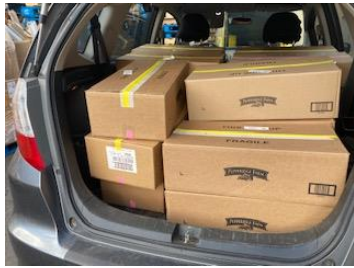
Pepperidge Farm boxes holding 20 cases of WCCC lettuce